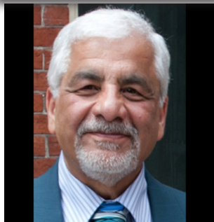
IEEE CTS Chairman